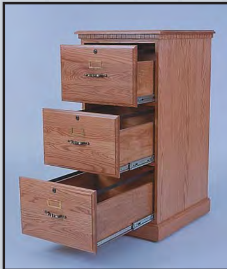
#93 3-Drawer 24" D x 21 1/4" W x 43" H