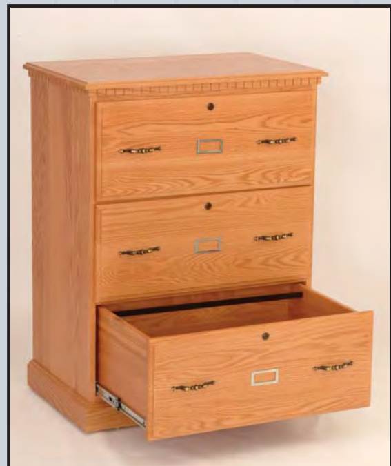
#203 3-Drawer Lateral 20" D x 32" W x 43" H