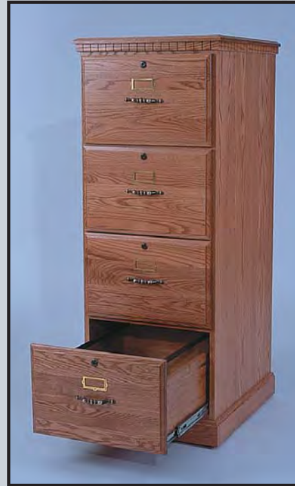
#94 4-Drawer 24" D x 21 1/4" W x 55 1/4" H