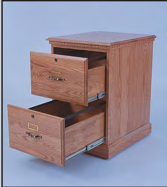
#92 2-Drawer 24" D x 21 1/4" W x 30 3/4" H