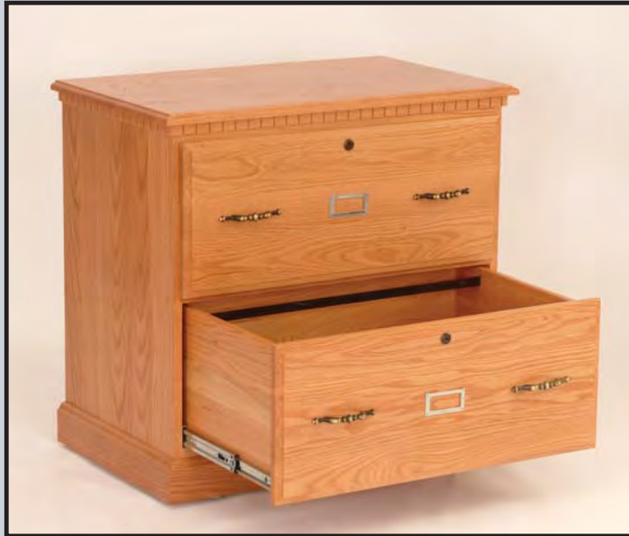
#202 2-Drawer Lateral 20" D x 32" W x 30 3 / 4 "H