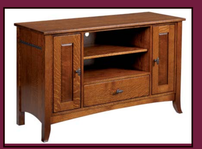
#471 Cranberry TV Stand 50"W x 18"D x 30"H (Shown)

Also Available: #470 TV Stand 45"W x 18"D x 30"H