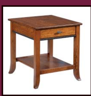
#421 Cranberry End Table 22"W x 24"D x 24"H