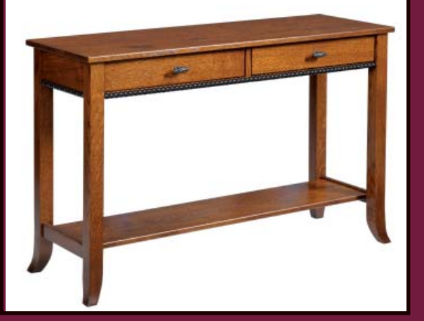
#427 Cranberry Hall Table 48"W x 16"D x 30"H