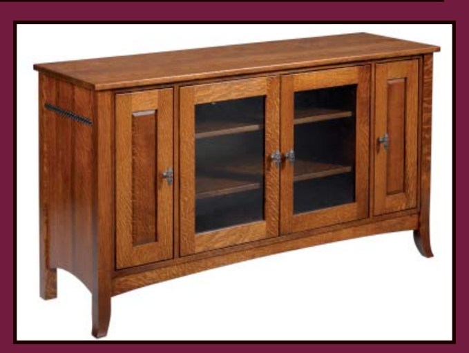
#473 Cranberry TV Stand 60"W x 18"D x 30"H (Shown)

Also Available: #470 TV Stand 45"W x 18"D x 30"H