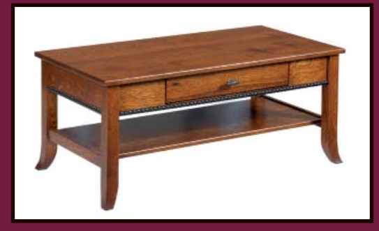
#424 Cranberry Coffee Table 42"W x 22"D x 18"H