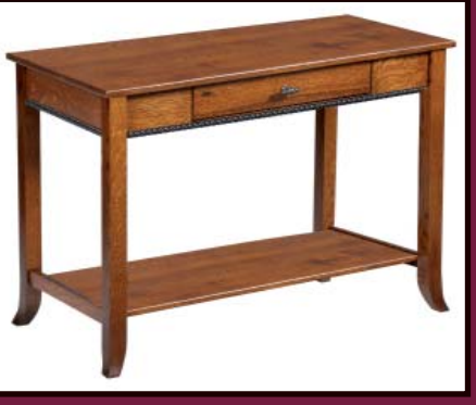
#426 Cranberry Sofa Table 36"W x 18"D x 30"H