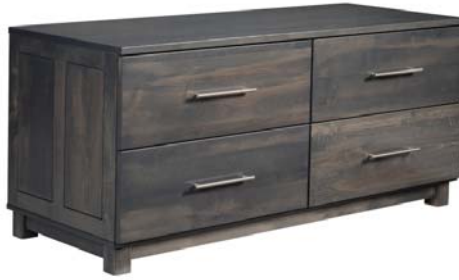
#1880 Lateral File Credenza

60"W x 24"D x 30¾"H Four lateral file drawers