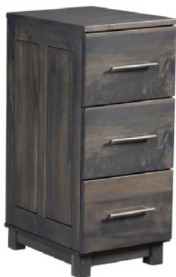
#1892 2-Drawer File