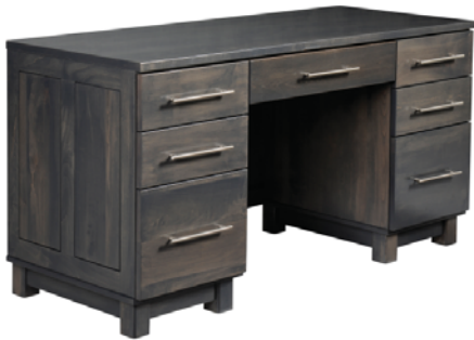
#1877 Pencil Desk

60"W x 14½"D x 40¼"H Two adjustable shelves