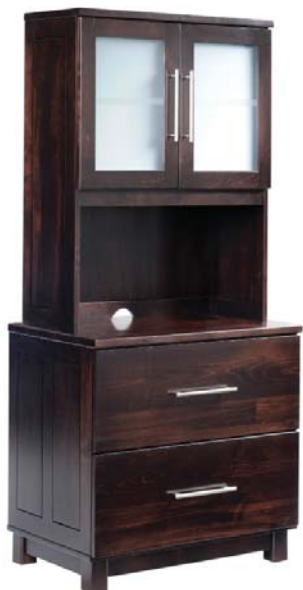
#1888 Hutch (optional)

Bookcases - Lateral File Shown in Brown Maple w/ O.C.S.230 Onyx