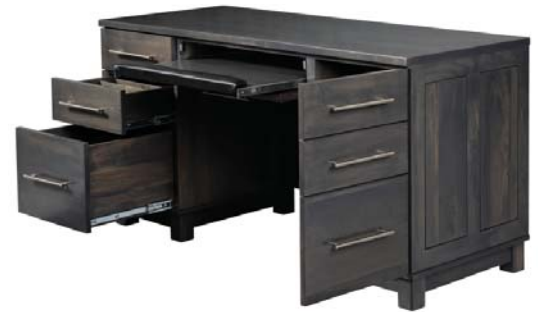
#1878 Computer Desk

60"W x 24"D x 30¾"H One pencil drawer, four storage drawers, two file drawers